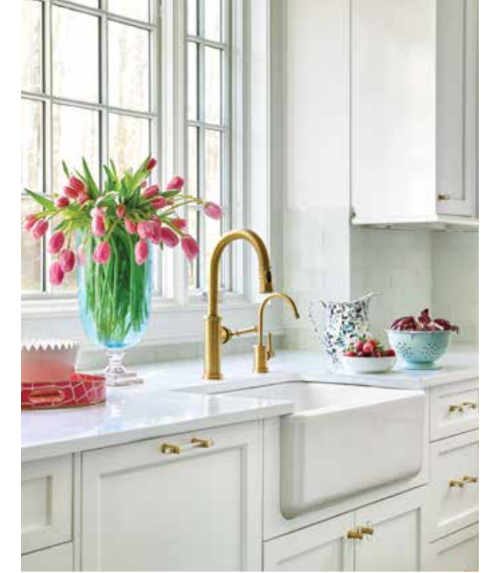
ABOVE: A brass faucet and brass hardware warm the white kitchen. BELOW: White trim pops against the turquoise and royal blue of the family room's walls and furniture. Hot pink, lime green, and color-block prints from the late Wendy Concannon add zip. FACING PAGE: Little shots of color, including the bright pink lanterns, add a cheerful note to the kitchen.

The foyer acts as a thematic connection between what Morgan calls the "yin and yang" of the dining and living rooms. Rather than the expected dark wood floor, Morgan brought in decorative painter Shelly Denning, who laid down a coat of soft white paint then added a lattice of blue and coral. "I adore painted floors," Morgan says. "This one